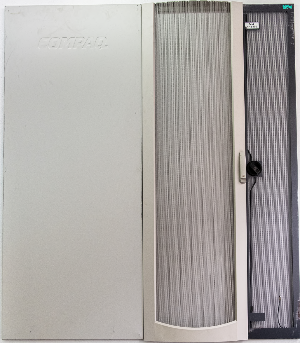
Always polite, 2024, Server racks, 196x172x8cm