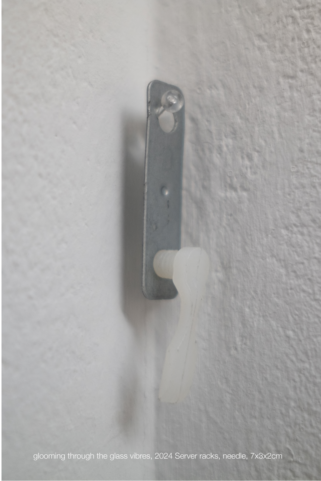
glooming through the glass vibres, 2024 Server racks, needle, 7x3x2cm