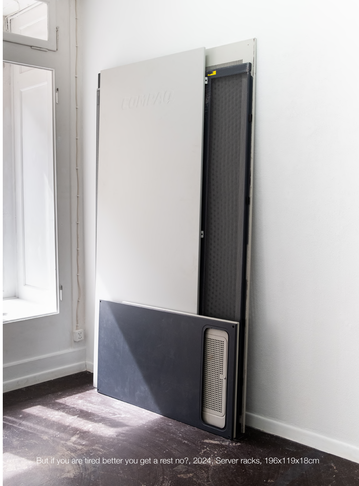
But if you are tired better you get a rest no?, 2024, Server racks, 196x119x18cm