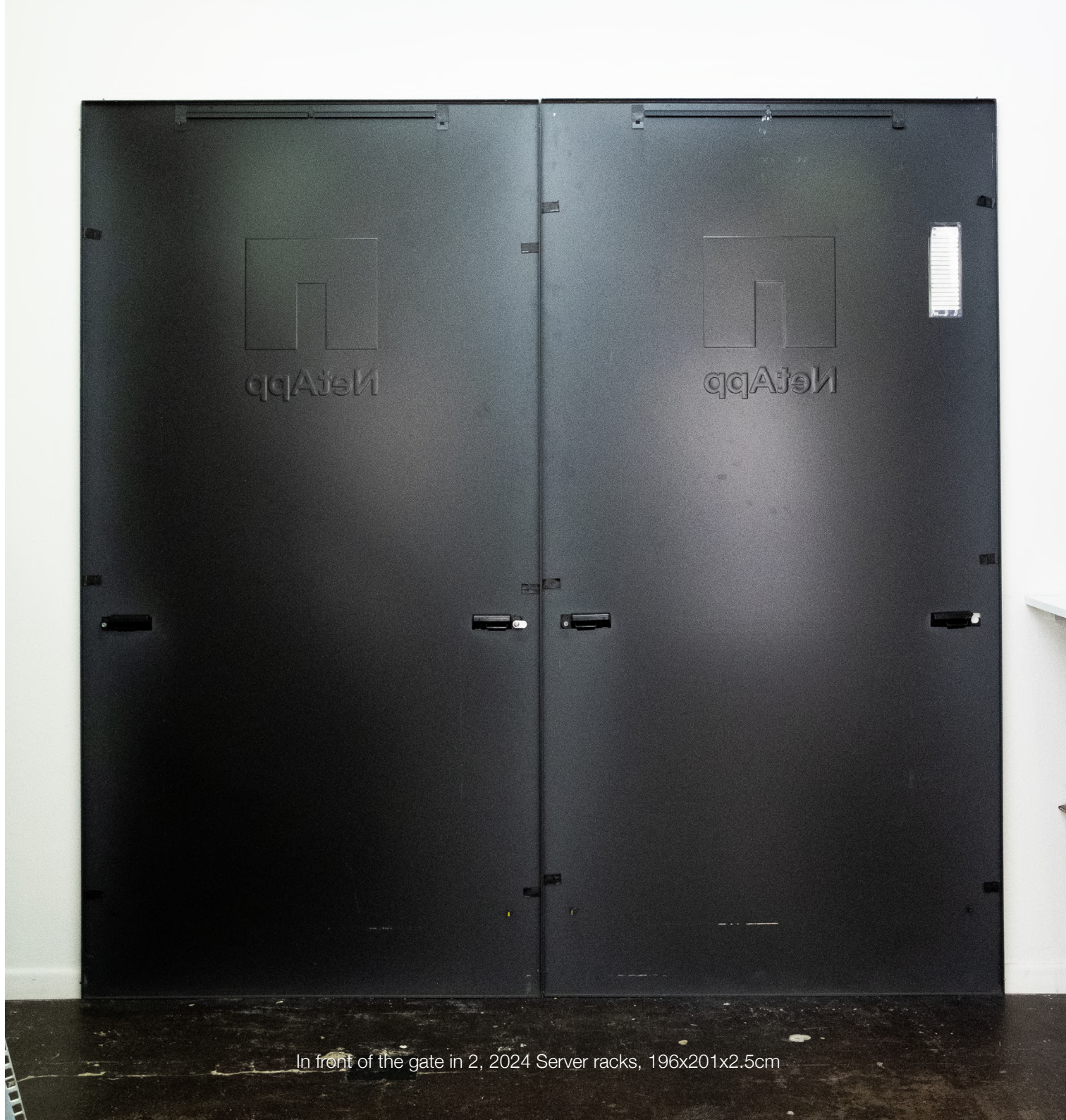
In front of the gate in 2, 2024 Server racks, 196x201x2.5cm