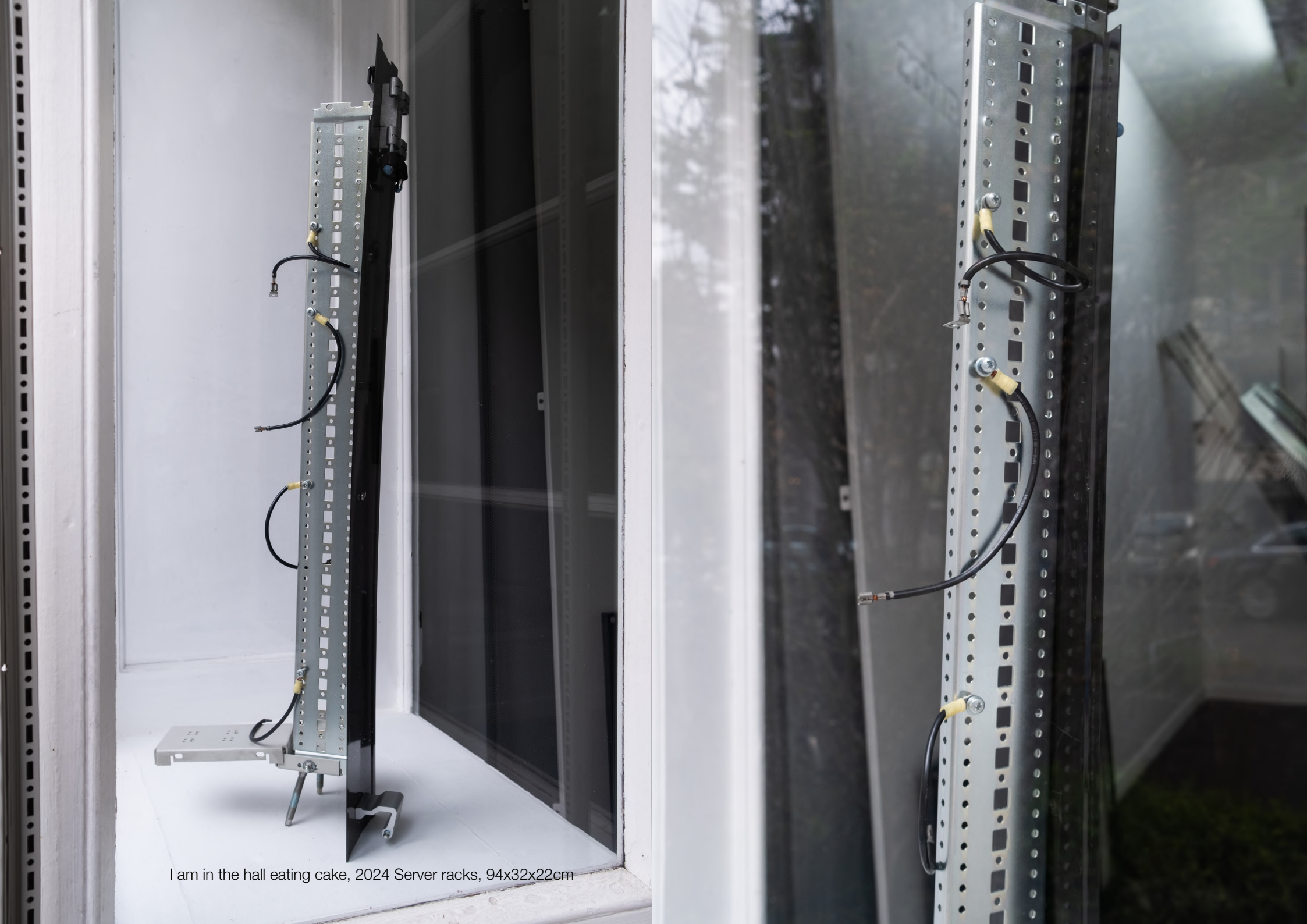
I am in the hall eating cake, 2024 Server racks, 94x32x22cm